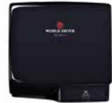
Aluminum , Black