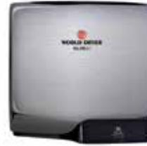
Aluminum , Brushed Chrome