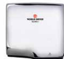
Stainless Steel , Polished