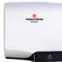
Aluminum , White