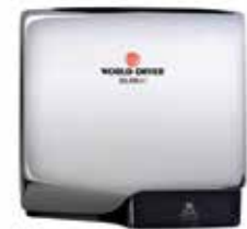
Aluminum , Polished Chrome