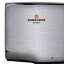
Stainless Steel , Brushed